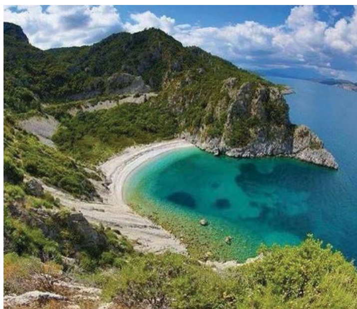
DILEK PENINSULA - II