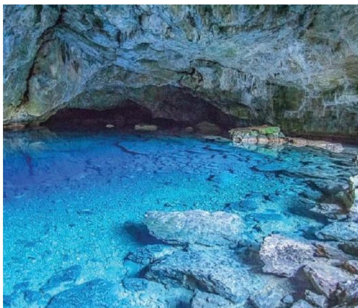
DILEK PENINSULA - I

Visit of DILEK PENINSULA at where one can find the best examples of Aegean and Mediterranean Flora. One may also find the examples of Black Sea Region flora on the North hills of the Peninsula. DILEK PENINSULA being one of the important national parks of Turkey forms a very convenient Delta for keeping most of the immigrant birds travelling to Northern hemisphere and unique Flora, which contains several endemic samples. Return to Hotel for dinner and overnight.