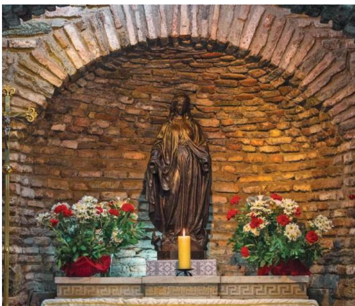
VIRGIN MARY HOUSE

Departure for Sunday Mass. After the Mass Visit of the open Air steam Locomotive Museum at where 30 different steam Locomotives built between the years 1887 through 1952 by German, British, French American, Swedish and Czech manufacturers are exhibited. Return to Hotel for dinner and overnight.